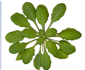
Auxin regulates growth in all land plants from Physcomitrella patens (left) to Arabidopsis thaliana (right).